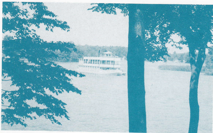
Friends waiting to board the Princess.